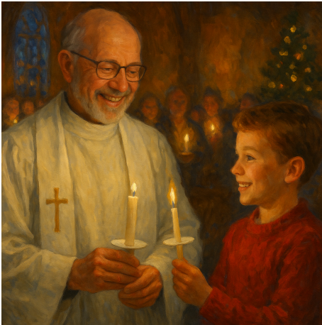
The Christmas Eve Candle That Wouldn't Stay Lit